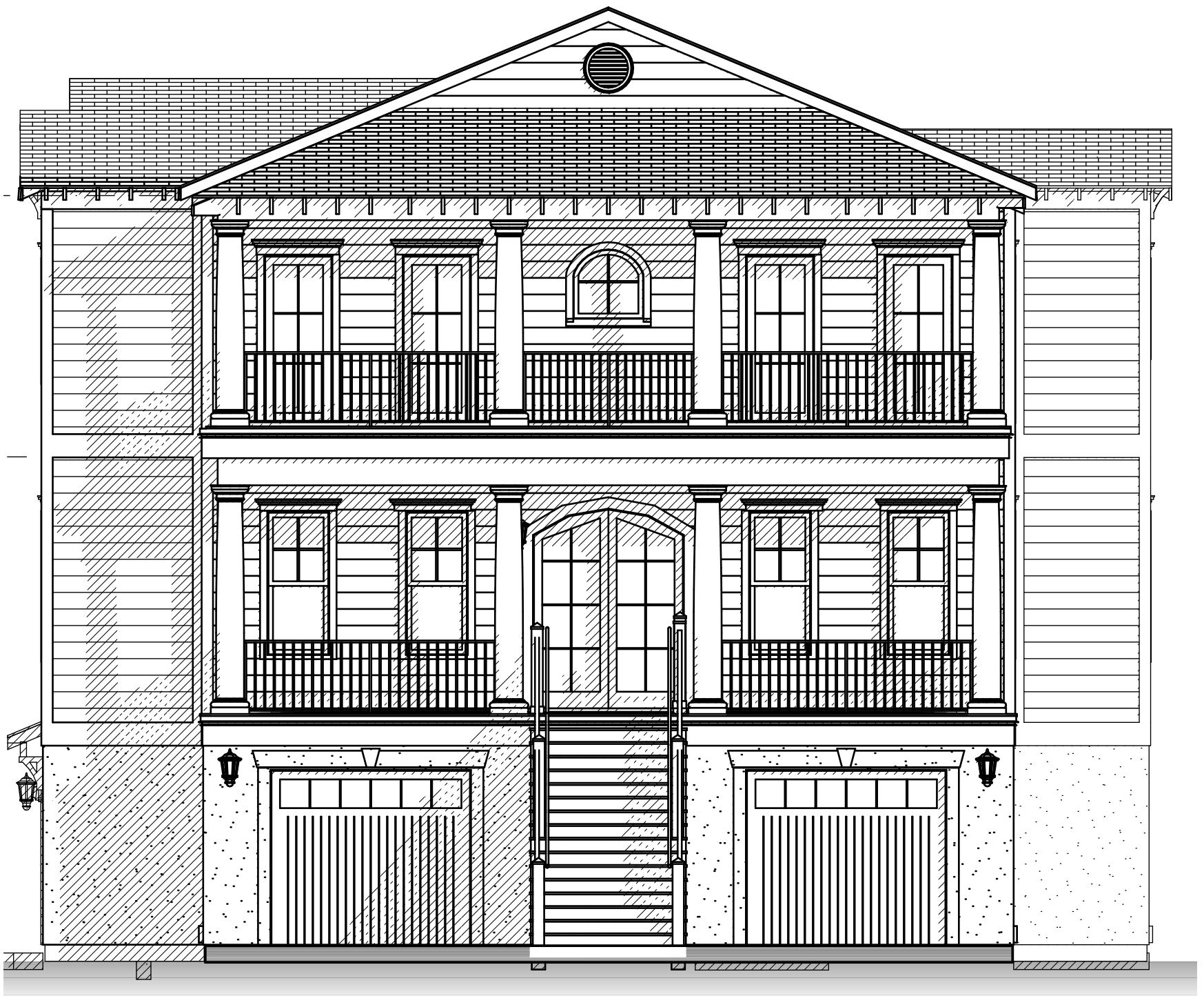
FRONT ELEVATION - THE ELLINGTON